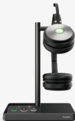
WH62 Dual Teams WH62 Dual UC