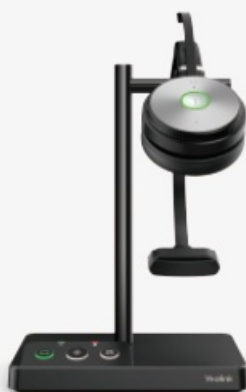
WH62 Mono Teams WH62 Mono UC