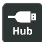
Built-in USB Hub