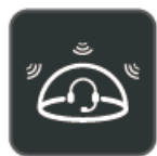
Acoustic Shield Technology