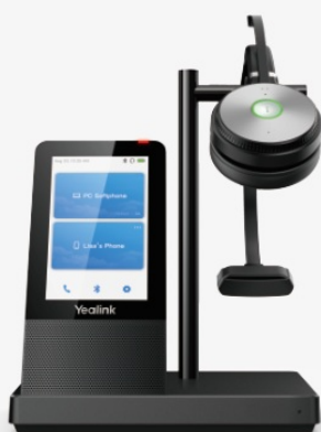
WH66 Mono: Teams WH66 Mono: UC