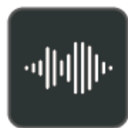
Optimal Audio Experience