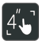
Touch Screen LCD