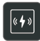
Qi Wireless Charger