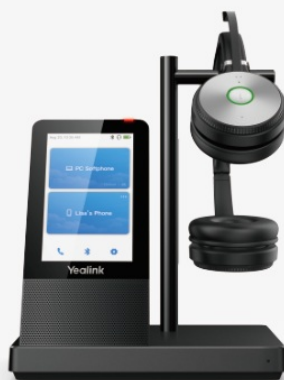
WH66 Dual: Teams WH66 Dual: UC