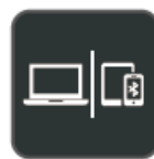
Multiple Devices Connection